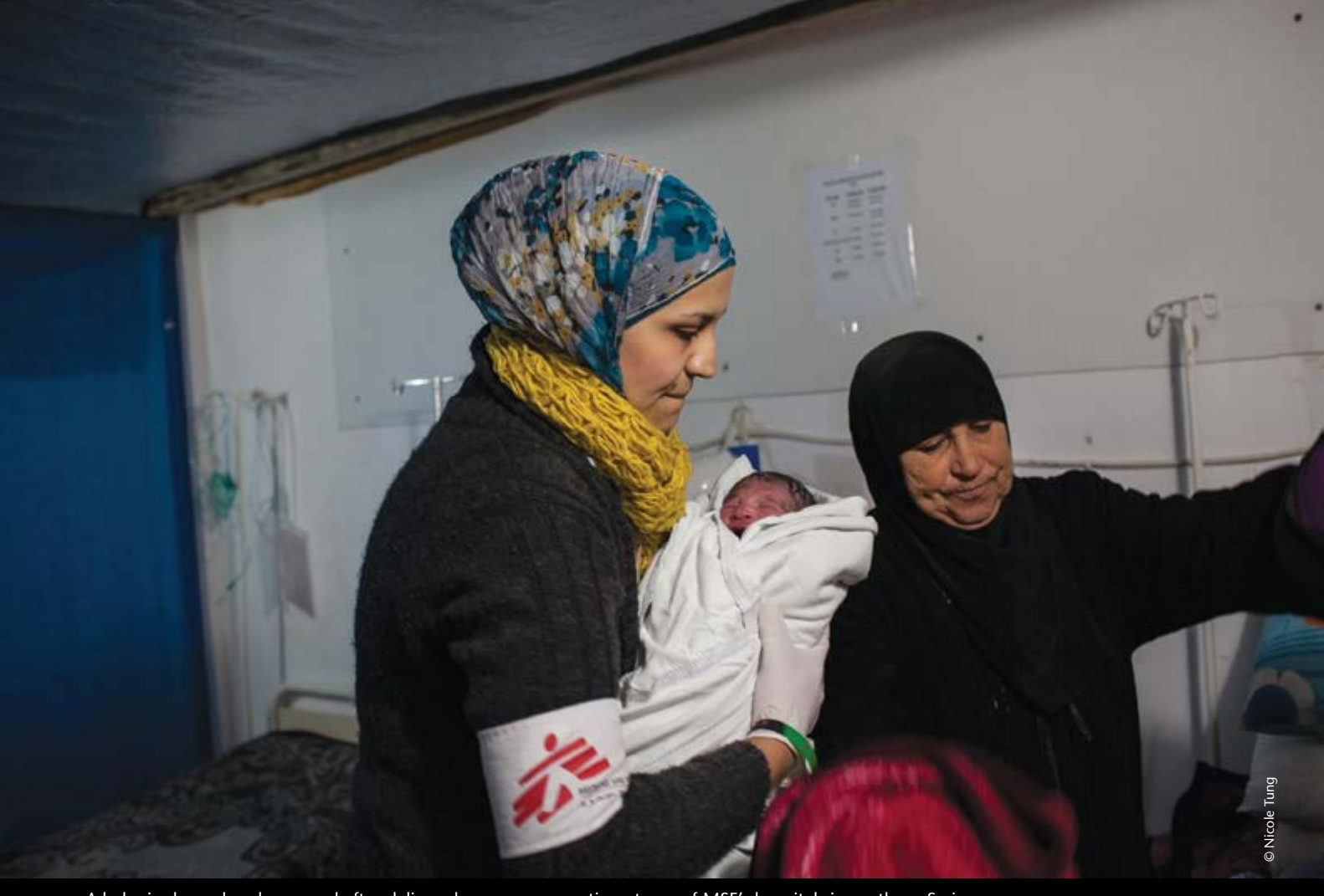
A baby is cleaned and wrapped after delivery by caesarean section at one of MSF's hospitals in northern Syria.