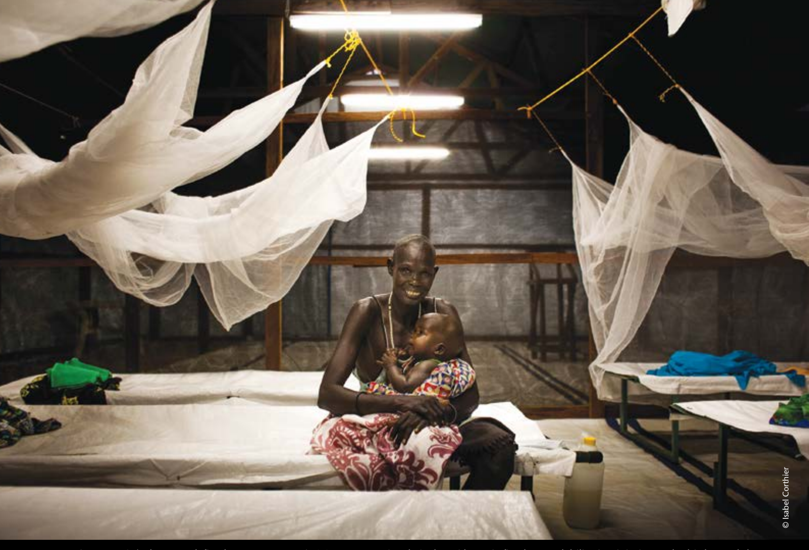
A patient at MSF's three-week fistula surgery camp in Warrap state, South Sudan. Obstetric fistulas are debilitating injuries to the birth canal that cause incontinence and often lead to social stigma.