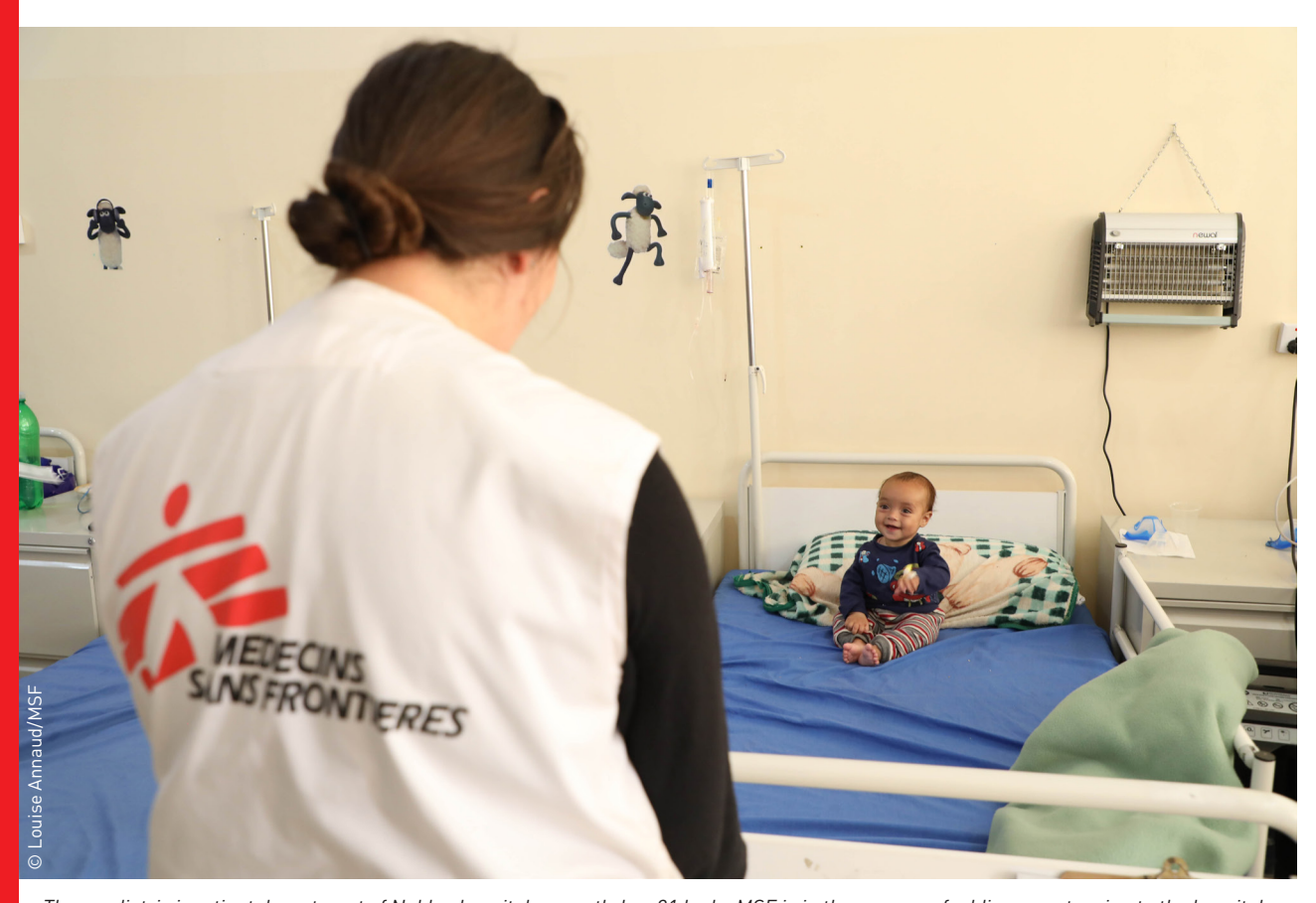
The paediatric inpatient department of Nablus hospital currently has 31 beds. MSF is in the process of adding an extension to the hospital, which will increase the capacity to 40 beds.