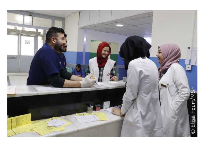
Medical staff at Imam Ali Hospital in Sadr City.

1 Genexpert Machine donated to the Chest and Respiratory Clinic of Rusafa