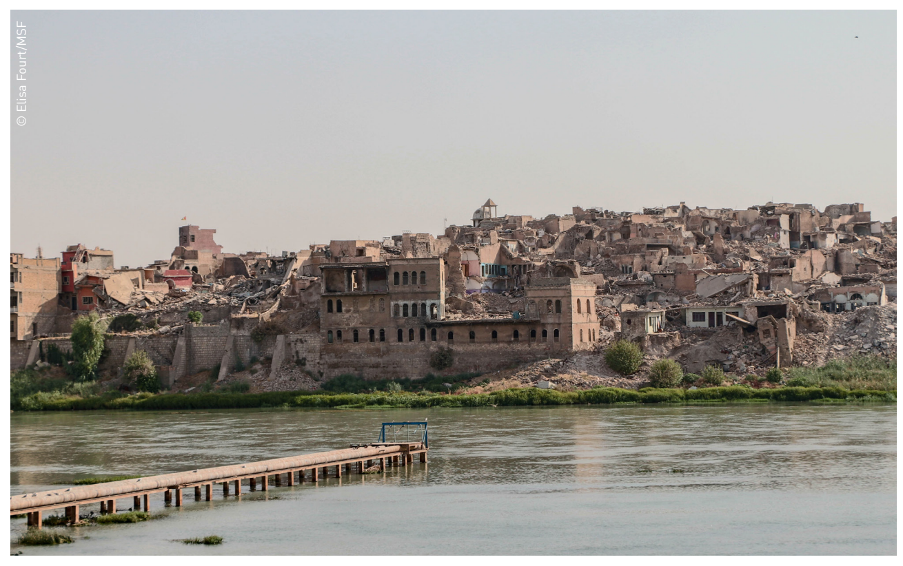
Views on West Mosul, from the East bank of the Tigris river.