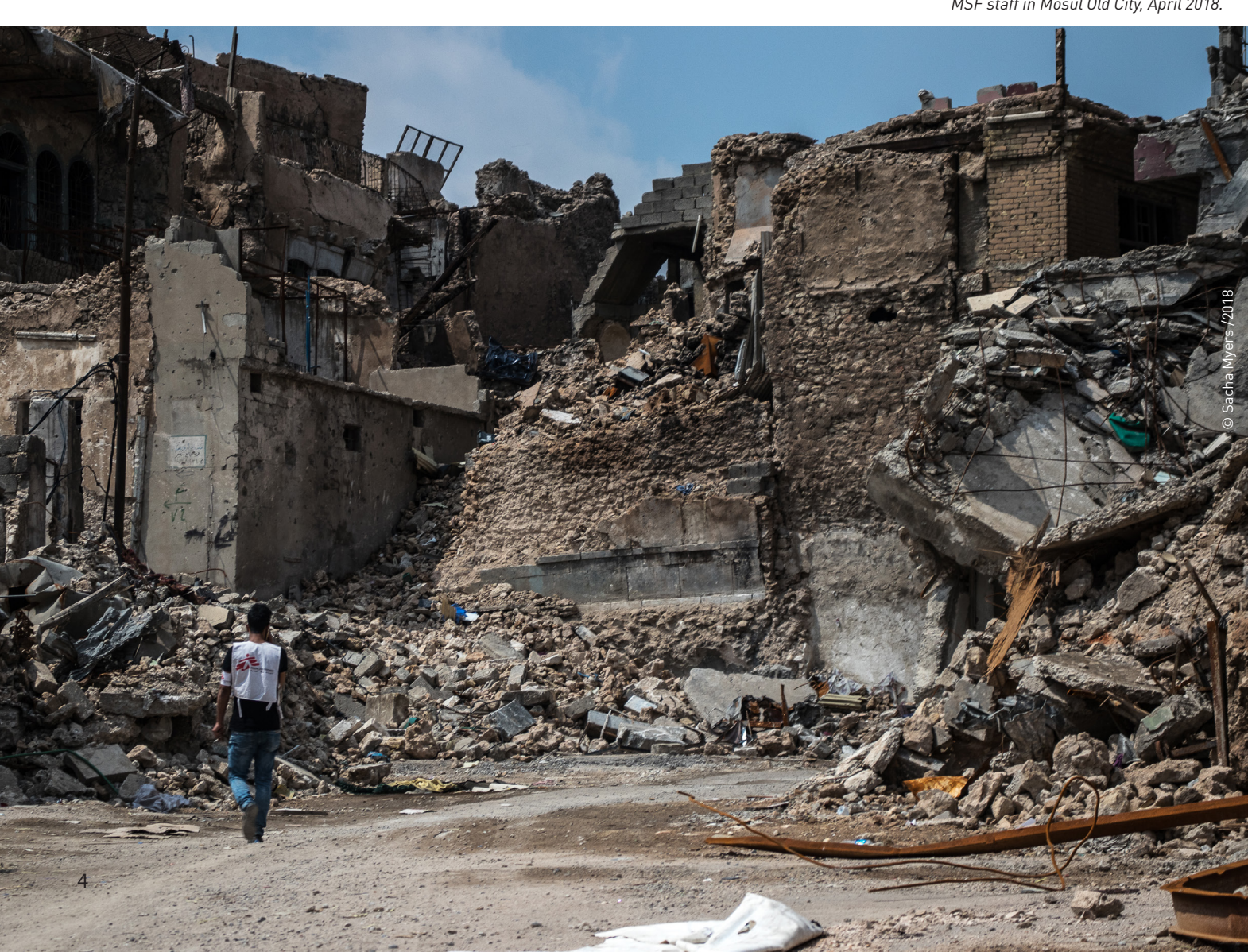
MSF staff in Mosul Old City, April 2018.

We take responsibility of accounting for our actions to our patients and donors, and being transparent on the choices we make. Evaluations, critical reviews and debate on our field practices, our public positioning and on wider humanitarian issues, are necessary to improve what we do.