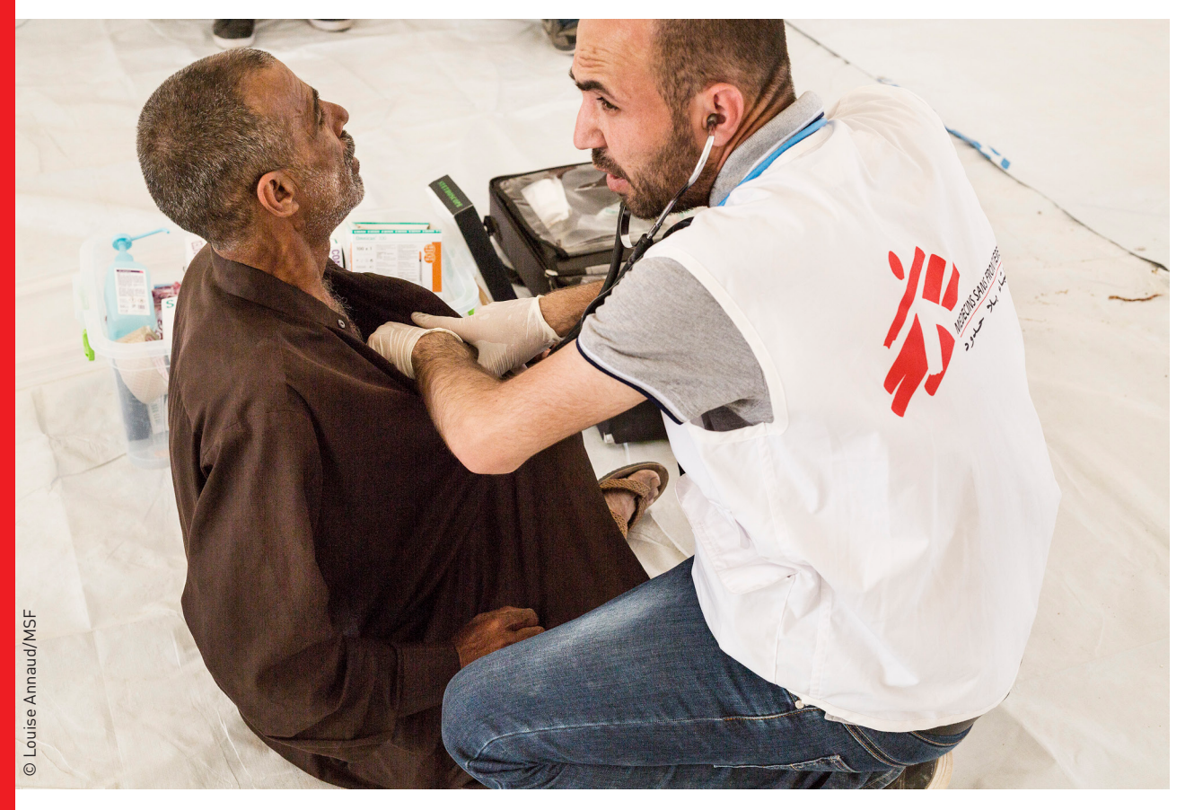
U2 refugee camp for internally displaced people, fled from the violence in Mosul. In the picture a doctor of MSF is taking care of the refugees who just arrived at the camp.