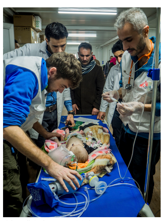
Infant suffering from pneumonia in the emergency room, in Qayyarah hospital.

Emergency Room fully rehabilitated with triage system, a pharmacy, and two consultation rooms