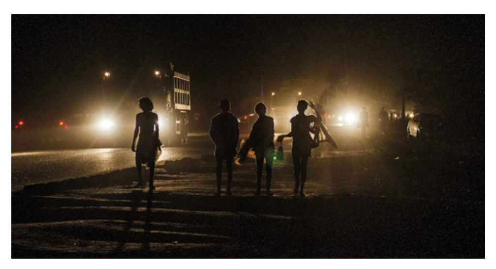
Night falls in the port town of Beira, Mozambique, along the transport corridor linking Malawi, Zambia and Zimbabwe

MSF's experience of providing SW and MSM services has demonstrated that care can be delivered in a collaborative way with MoH and civil society. Still, more needs to be done. Integrated health services adapted for KP needs must be fully funded and scaled up if the UN stated ambition to 'leave no one behind' is to be more than just a slogan.